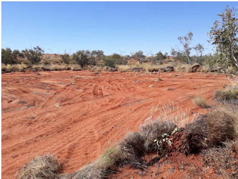
Figure 1: All drill pads have been cleared at Paterson's Grace Gold-Copper Project

Paterson's Executive Director Matt Bull commented on the results, "Over the last month, the Paterson field team has been on-site preparing drill sites ready for our next big drilling push at the Grace Gold-Copper Project. Drilling is following on from our maiden program where we successfully extended gold mineralisation along the Grace-Bemm shear a further 200 meters and defined an intriguing splay off the main trend with significant high-grade shallow incepts. We are also targeting some compelling gold anomalies in historic drill holes, many of which were pulled up short in mineralisation and have yet to be followed up. This is an exciting time for the company"